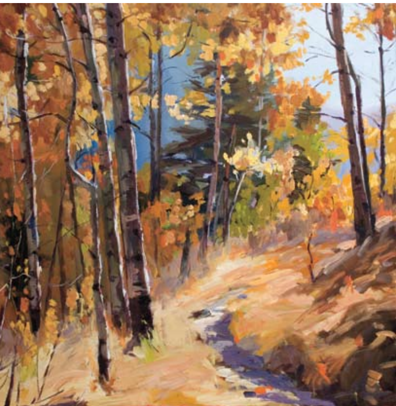
Glorious Fall , oil, 30 x 30"