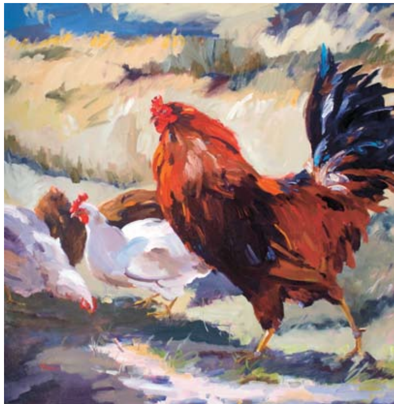
Don Juan , oil, 30 x 30"